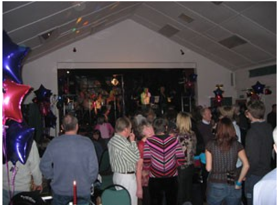
Local charity fund raising events