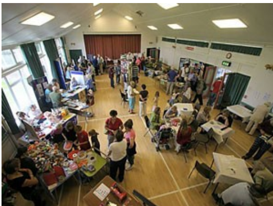
HWMH users open day