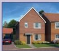
The Honeysuckle 3 Bedroom Home Available from £367,950