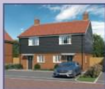
The Cornflower 2 Bedroom Home Available from £299,950