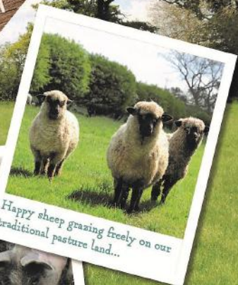
Happy sheep grazing freely on our traditional pasture land...

Come to our shop in East Hanney where our fabulous team are always happy to help. You will find a full range of delicious award-winning pork products, our home produced lamb, eggs, vegetables, take-and-bake bread and pies. You can now also buy hot breakfast rolls, made to order sandwiches, coffee and groceries. See you soon.