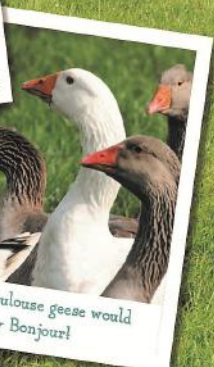
Our serene Toulouse geese would just like to say Bonjour!