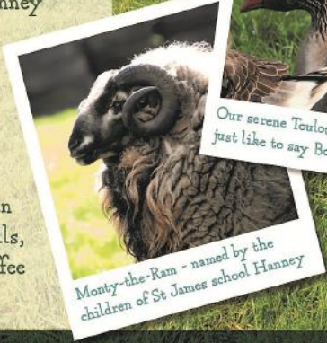
Monty-the-Ram - named by the children of St James school Hanney

FREE LOCAL DELIVERY • CALL FOR MORE DETAILS