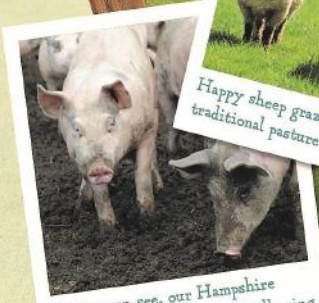
As you can see, our Hampshire cross pigs love rooting and wallowing