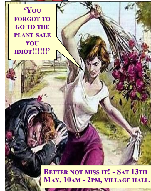
'YOU FORGOT TO GO TO THE PLANT SALE YOU IDIOT!!!!!!'