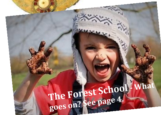
The Forest School - What goes on? See page 4.

Hannee News Association (HNA) and its members take no responsibility for anything that appears in Hanney News or its 'flyers', be it comment, opinion, information or advice. Neither does HNA warrant the work undertaken, services provided or advice given by any of its advertisers. The Editor reserves the right to alter, omit or hold over copy to a future issue. All material is copyright.