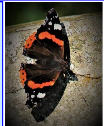
A Red Admiral Butterfly.

The service will be followed by lunch for all who wish to stay