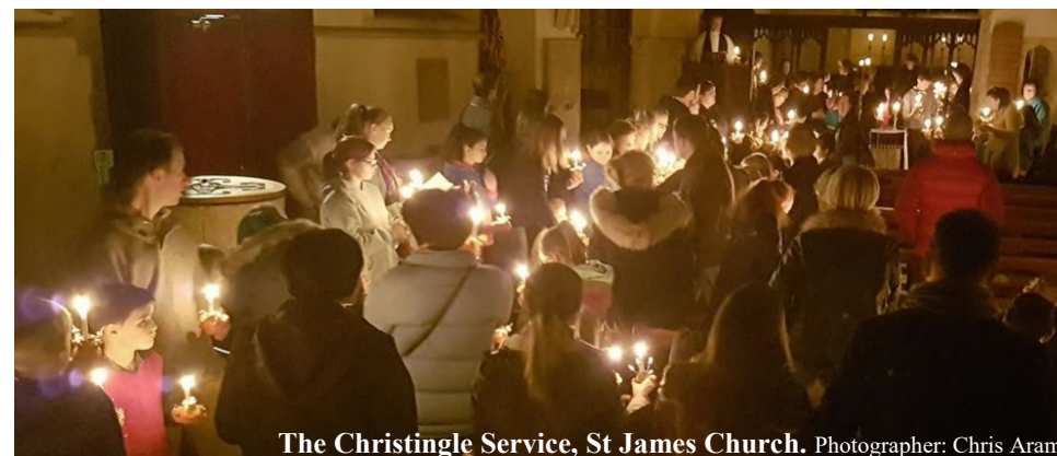
The Christingle Service, St James Church.