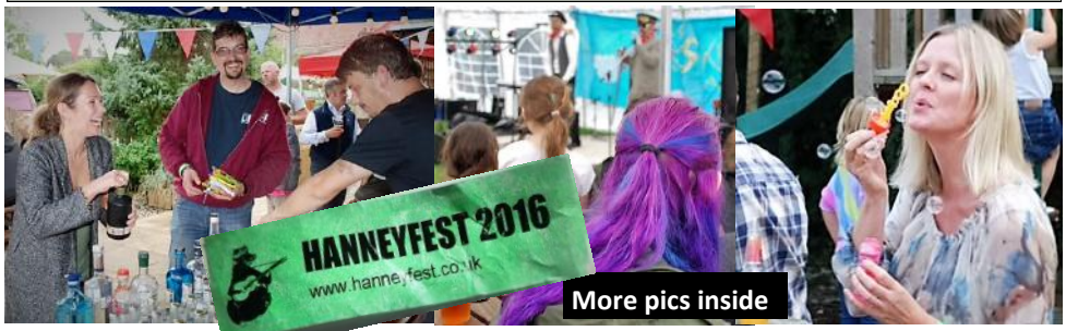
More pics inside

Hannee Parochial Charities...update The deadline for applications for an award has been extended...see page 11.